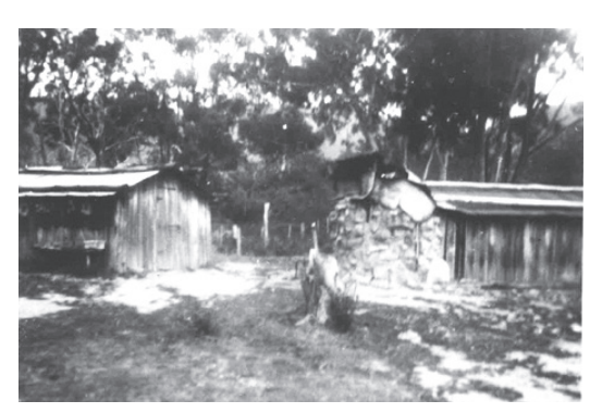
BELOW: 'The Czechs' camp' at Tidbinbilla River.

in oil distillation in the late 1940s. In 1947 the district produced some 367 276 pounds (167 tonnes) of oil, with a value of about £50 000. However, from early in 1948 downturn was forecast, due largely to currency fluctuations affecting the American market, coupled with industrial unrest in Australia. Additional factors in this decline included post-World War II increases in labour costs, such that Australia was no longer competitive with overseas production, and increased priority being placed on wheat exports, leading to greater profitability in wheat farming and significant decrease in stands of high quality eucalyptus species. B