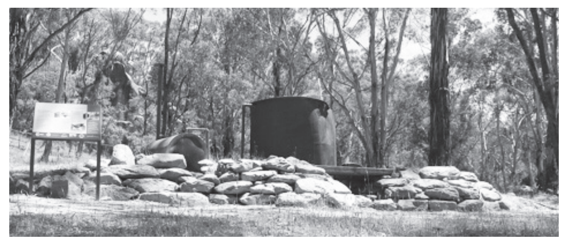
ABOVE: Reinstated and interpreted still at the Black Flats car park, 2020.