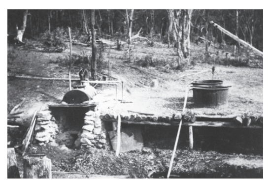
BELOW: 'The still at Hurdle Creek.

The steam was captured by one or more 2 inch (5cm) pipes close to the top of the tank. The condenser pipes then passed through a water race, stream or dam to condense the vapour, or in drier places through a 'worm coil' in an additional tank of water. The condensate would be captured at the end of the pipe in a collector drum where the oil separated from the water. To fill a 44 gallon drum would require around 4 to 5 tonnes of