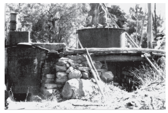
BELOW: The still at Tidbinbilla River c.1948.

It is worth noting that some operators in the local district departed the industry